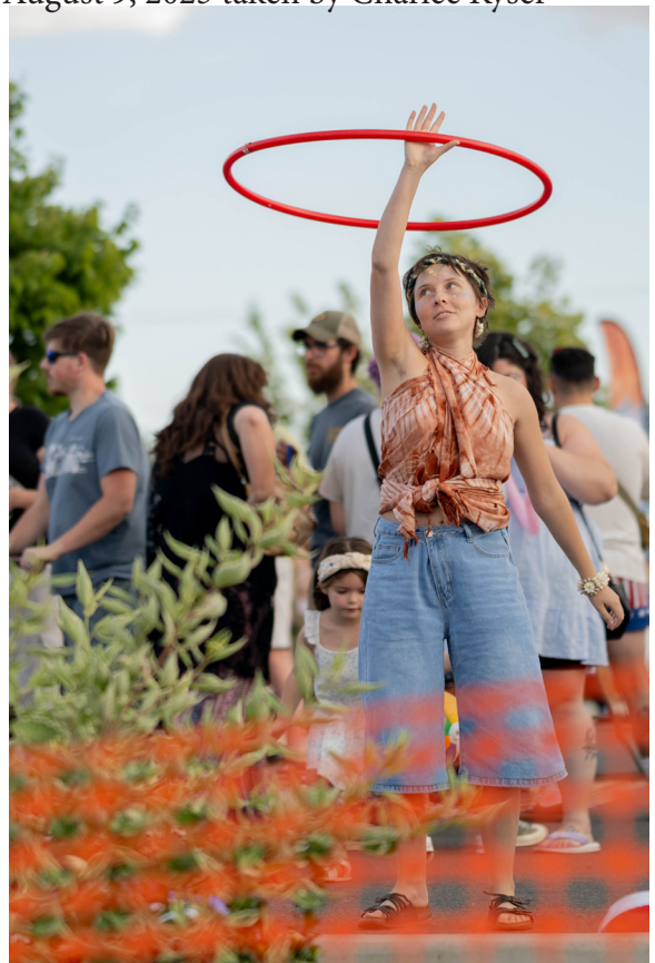
Action photo of hoola hooper at Spokane Night Market August 9, 2025

the human experience. Having been to many markets, I can say that this one is my favorite, for the community aspect and the feeling of belonging, it brings. It's an experience, not a market.