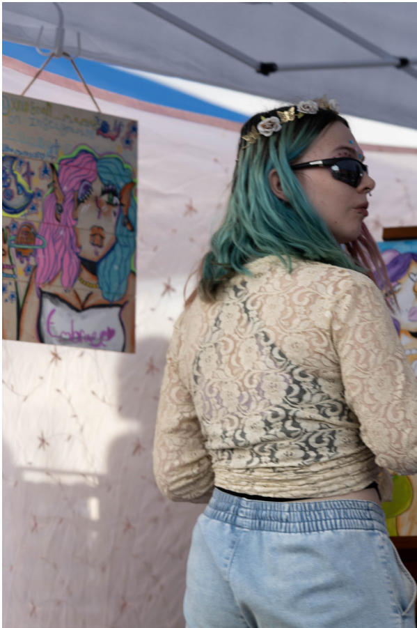
Portrait of attendant at Mermaid Spokane Night Market August 9, 2025

watch the coming and goings of trains and cars. The trains rumble along the tracks right below the center, making the bridge shake. It's also a really unique place to do night photography, as you get the lights of downtown a little bit further off and the nearby buildings lit with lights from apartments above shops and restaurants.