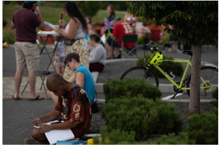
Action Shot of artists at Mermaid Spokane Night Market August 9, 2025

As we returned to the market, a gal sat on the side walk, awaiting a ride. She held a little bird cage and was dressed in bright makeup, fitting the mermaid theme. Something about this stood out as unique and culturally significant. The idea of bridging people even more apparent, as she did not fit into what feels like a norm for Spokane. It brought to the forefront the fact that this market was about community and art. It was more than a place to sell, but also a place to live and thrive with like minded people. This particular market is a place to tell stories, and live stories. It's about bringing people together and creating a common area for people to mingle, talk, draw together, and just enjoy